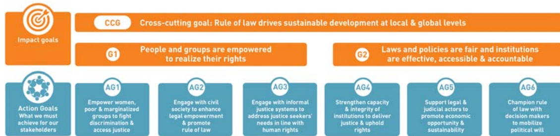
Diagram 1: Strategy 2020 Impact and Action Goals

The two Impact Goals are achieved through six Action Goals or thematic areas, as shown in Diagram 1 below.