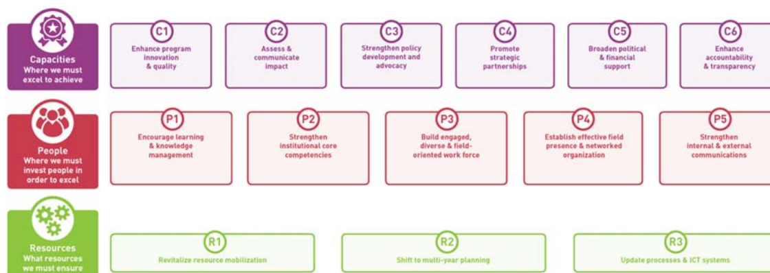
Diagram 4: Extract from Strategy 2020 Map showing Organizational Goals